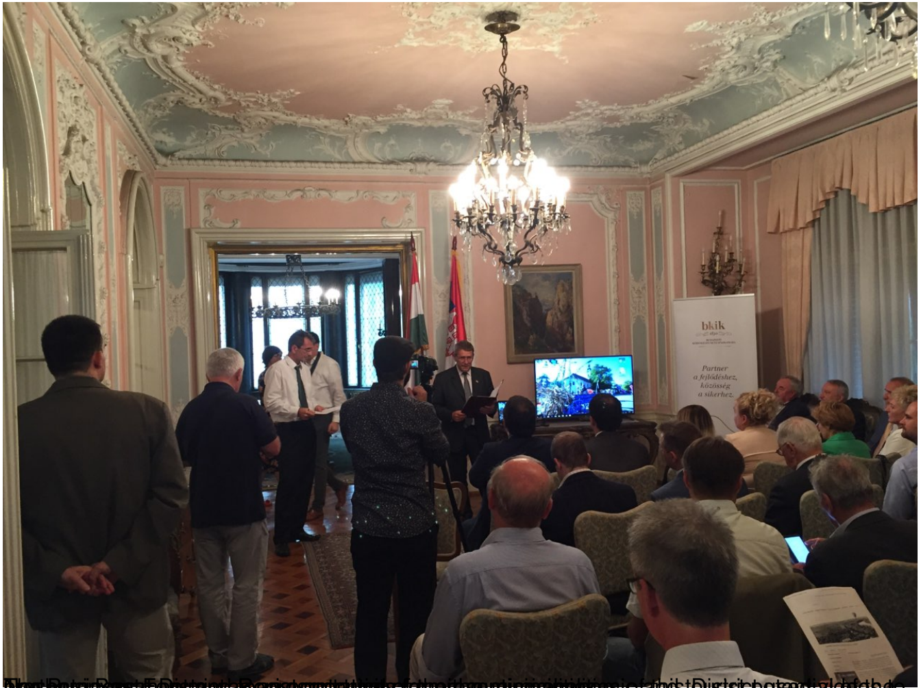
The Business Forum in Budapest was a successful event for both countries and participants.