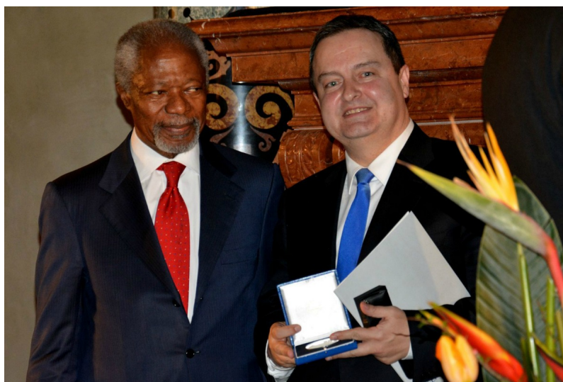
"Evald von Kleist" Award Ceremony Prize" Award Ceremony

By its decision of 10 February 2012, the OSCE Ministerial Council decided that Serbia would hold the OSCE Chairmanship-in-Office in 2015, in the framework of its joint Chairmanship bid with Switzerland, which would serve as Chair in 2014. This new model of OSCE's two-year consecutive and coordinated Chairmanship will ensure, for the first time, a follow-up on the leadership and longer-term planning of OSCE activities. Switzerland and Serbia drafted and, on 2 July 2013, presented to the OSCE Permanent Council in Vienna their Joint Workplan .